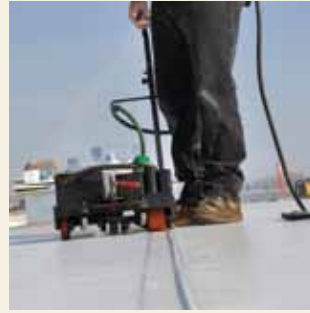
3. Weld seams by hand or with a robotic welder.