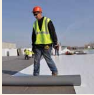
2. Apply membrane, overlapping seams in the direction of water run-off.