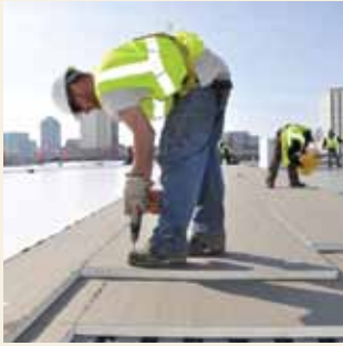
1. Remove all loose dirt and debris and install board stock.