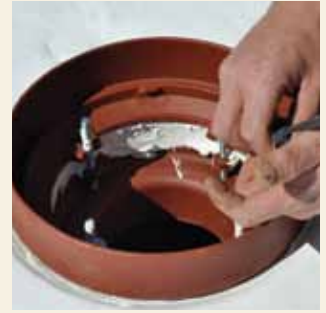
4. Seal free edges of membrane with urethane sealant.